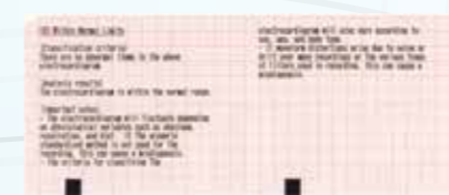
▲ Analysis Guide