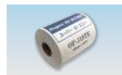
Printing Paper (Roll, OP-119TE)