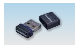
USB memory (USB-1G)