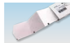
Printing Paper (Z-fold, OP-122TE)

FUKUDA DENSHI reserves the right to change specifications without notice.